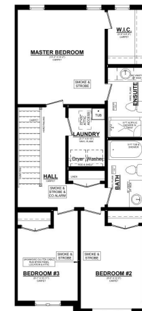
Ashton C UNIT #3 2ND FLOOR PLAN 910 SQ. FT. 8" CEILINGS ON 2ND FLOOR