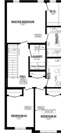
ASHTON C UNIT #1 2ND FLOOR PLAN 910 SQ. FT. 8" CEILINGS ON 2ND FLOOR