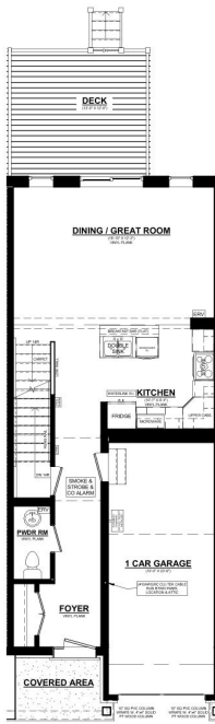
Ashton C UNIT #3 MAINFLOOR PLAN 690 SQ. FT. 8" CEILINGS ON MAINFLOOR