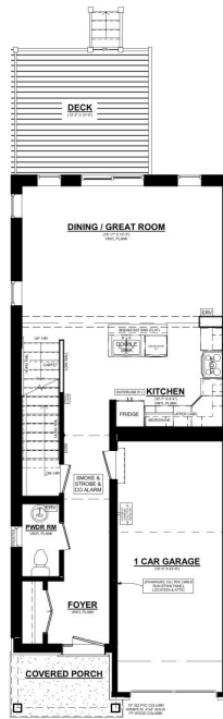
ASHTON C UNIT #1 MAINFLOOR PLAN 690 SQ. FT. 8" CEILINGS ON MAINFLOOR