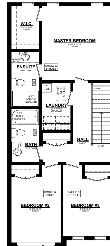
Ashton B UNIT #2 2ND FLOOR PLAN PLAN 910 SQ. FT. 8' CEILINGS ON 2ND FLOOR' CEILINGS ON 2ND FLOOR PLAN