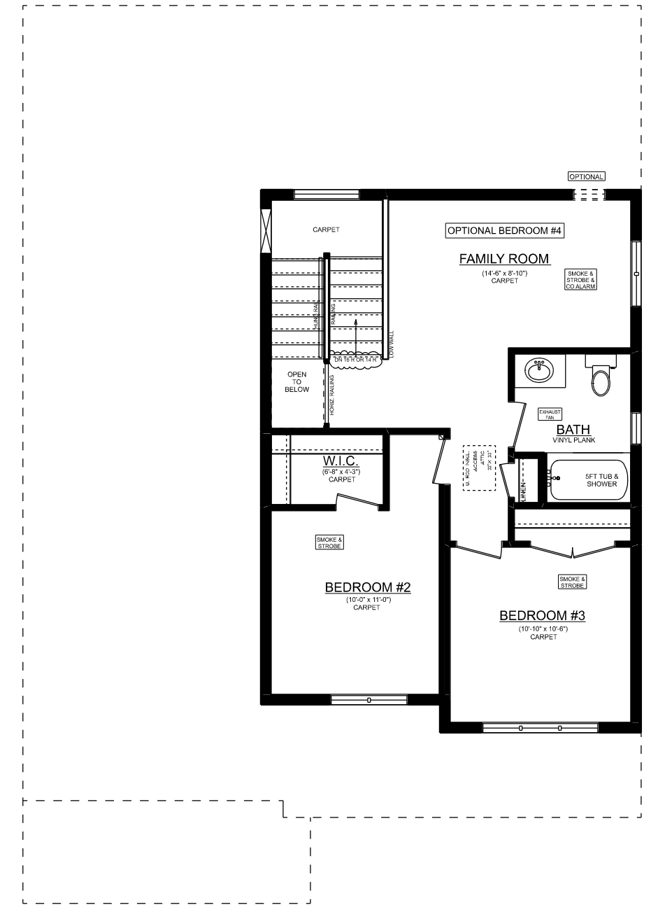
THE STONEHAVEN 'A' 2ND FLOOR PLAN 624 SQ. FT.

TO VIEW ADDITIONAL FLOOR PLAN OPTIONS VISIT OUR WEBSITE AT ( www.dougarryhomes.com )